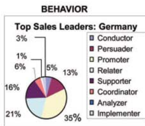
Study 2: Top Sales Leaders, Germany N=492