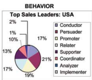
Study 1: Top Sales Leaders, USA N=178

Contact your TTI distributor for more information.